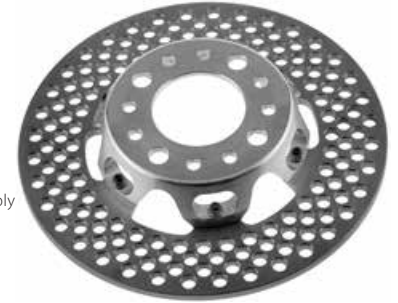
TDI Lightweight Brake Rotor Assembly Part No. 3540-01 Disc, Hat and Hardware Kit are also available separately.

improved braking and weight reduction. The complete hat and disc assembly for an LD 19 caliper weighs less than 3.6 pounds! The discs for LD 20 calipers are the same thickness as the LD 19 disc (.280 inch) for additional weight reduction. TDI rotors are made in the USA. Note: Some older Van Diemen uprights may require modification for rotor clearance.