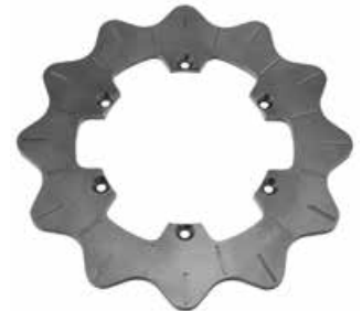
TDI Grooved and Scalloped Brake Disc Part No. 3544-002-01