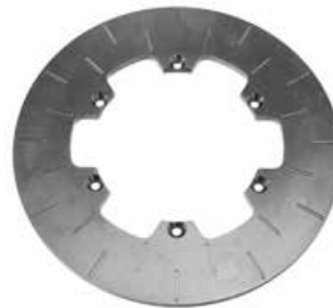
TDI Grooved Brake Disc Part No. 3544-001-01

9.85" OD (LD 19)..... Part No. 3544-002-01 ..... $184.99 10.12" OD (LD 20)..... Part No. 3544-002-02 ..... $184.99